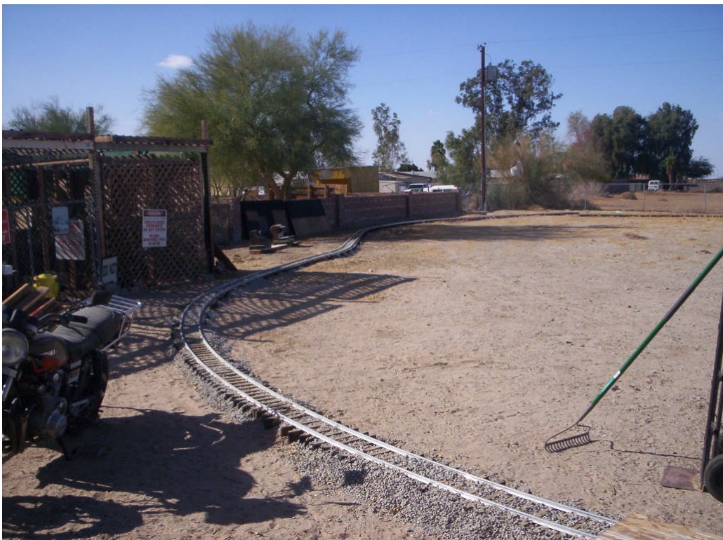
Paul Chapman's railroad shown from the grade crossing winding west. The vacant lot in the back ground will be the continuation of the rail line.